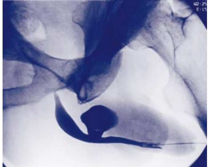
Figure. Urethrogram showing cavity

Are these an expected post-operative appearance?